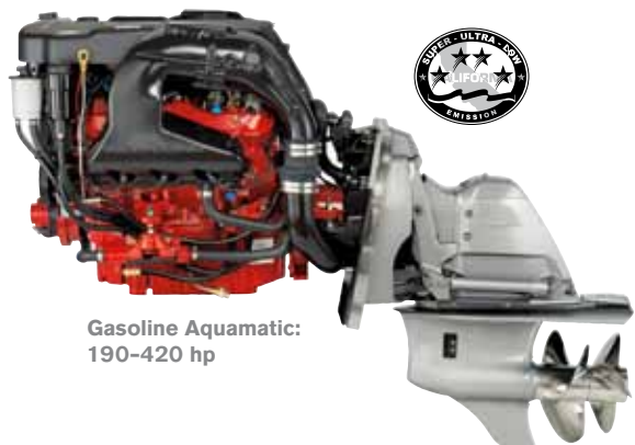
Gasoline Aquamatic: 190-420 hp