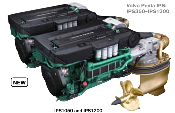
Volvo Penta IPS: IPS350-IPS1200