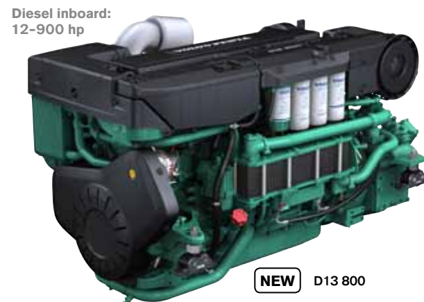
Diesel inboard: 12-900 hp

Service and support for the whole package, from helm to props, is available at your local Volvo Penta dealer. You have a single contact for your entire propulsion package, including all accessories from Volvo Penta. This is the true basis of easy ownership.